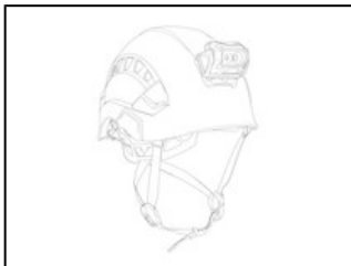
Plate for mounting a headlamp on a Petzl VERTEX or STRATO helmet, maintaining the ability to tilt the headlamp.

The SLOT ADAPT plate allows you to mount a compatible headlamp on a VERTEX or STRATO helmet.